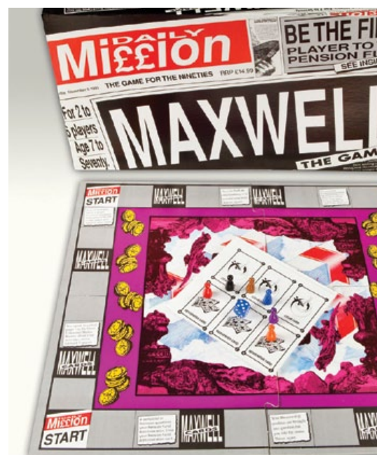
Maxwell: The Game 1991